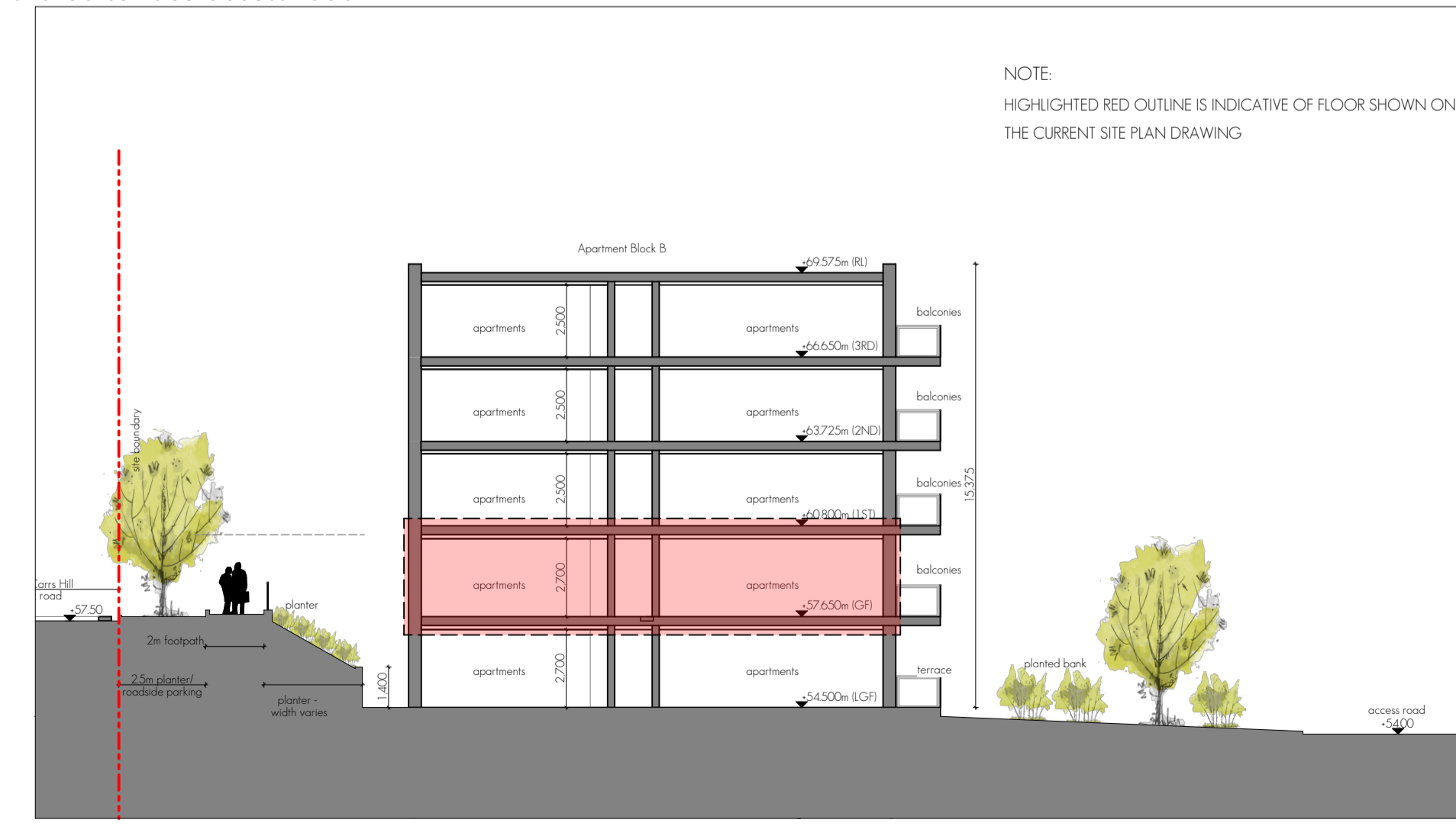
Section A-A 1:200

PLEASE REFER TO HQA REPORT 18205-REP-015, FOR ALL UNIT NUMBERS, ORIENTATIONS ETC